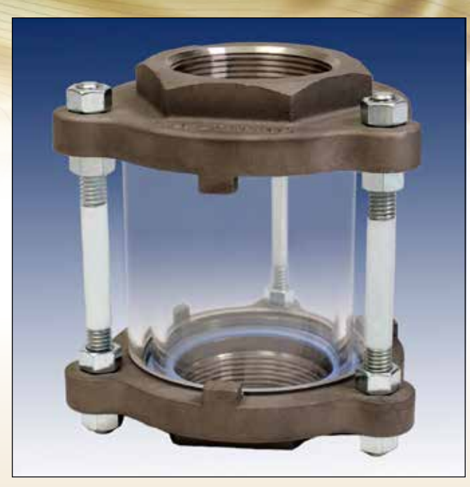
Full View Threaded Visual Flow Indicator